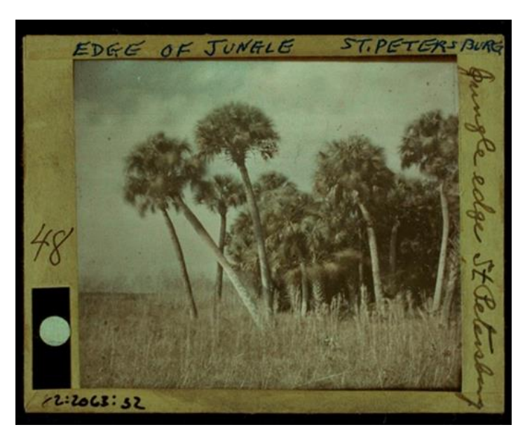
Figure 3: Charles Zoller, Edge of Jungle, St. Petersburg, Autochrome, ca. 1923, Courtesy of George Eastman House Gift of Mr. & Mrs. Lucius A. Dickerson, 1982:2063:0032.

This image puts the viewer literally at the edge of the Florida wilderness with tall grass in the foreground and a tangled cluster of sabal palm trees as the focal point. Figure 4 leads us further into the Florida wilderness with a view down the Tomoka River. A dramatic juxtaposition of light and shade, this image aligns with Florida's turn-of-the-century reputation as an untamed wilderness. The hanging Spanish moss not only adds a slight romanticism to the image, but also serves as a reminder that Florida remains part of the south.