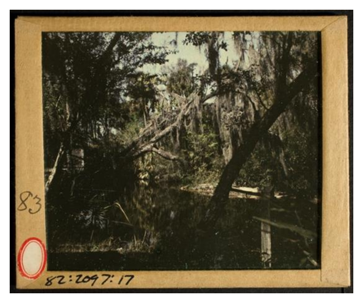
Figure 4: Charles Zoller, Tomoka River, Florida, Autochrome, ca. 1923, Courtesy of George Eastman House/Gift of Mr. & Mrs. Lucius A. Dickerson, 1982:2097:0017.

This image puts the viewer literally at the edge of the Florida wilderness with tall grass in the foreground and a tangled cluster of sabal palm trees as the focal point. Figure 4 leads us further into the Florida wilderness with a view down the Tomoka River. A dramatic juxtaposition of light and shade, this image aligns with Florida's turn-of-the-century reputation as an untamed wilderness. The hanging Spanish moss not only adds a slight romanticism to the image, but also serves as a reminder that Florida remains part of the south.