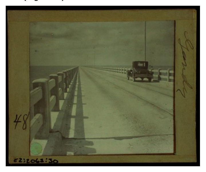
Figure 8: Charles Zoller, Gandy Bridge, Autochrome, ca. 1923, Courtesy of George Eastman House/Gift of Mr. & Mrs. Lucius A. Dickerson, 1982:2063:0030

But building in paradise continued unabated. An image that highlights Florida's progress towards modernization during this time is Zoller's image of the Gandy Bridge (Figure 8).