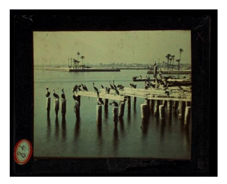
Figure 18: Charles Zoller, Pelicans on dock, Autochrome, ca. 1923, Courtesy of George Eastman House/Gift of Mr. & Mrs. Lucius A. Dickerson, 1982:2063:0059.

to his descriptions. Figure 18 lets us look out over the water with a large group of pelicans lined up on dock pilings. Because of a relatively slow shutter speed, the water and shadows in the foreground appear soft and add a sense of movement to the image. Figure 19 shows another sunset view over the water, this time over Mirror Lake in St. Petersburg. Again we have the silhouette of palm trees in the foreground and the water-color clouds in the background; however, this time the soft pinks and oranges come through brighter than in Zoller's other sunset image (Figure 2). Of course no travelogue of Florida would be complete without an image of citrus. There are several Zoller autochromes taken in Florida citrus groves; Figure 20 shows a citrus tree laden with fruit similar to the "mammoth globes" described by Zoller above.