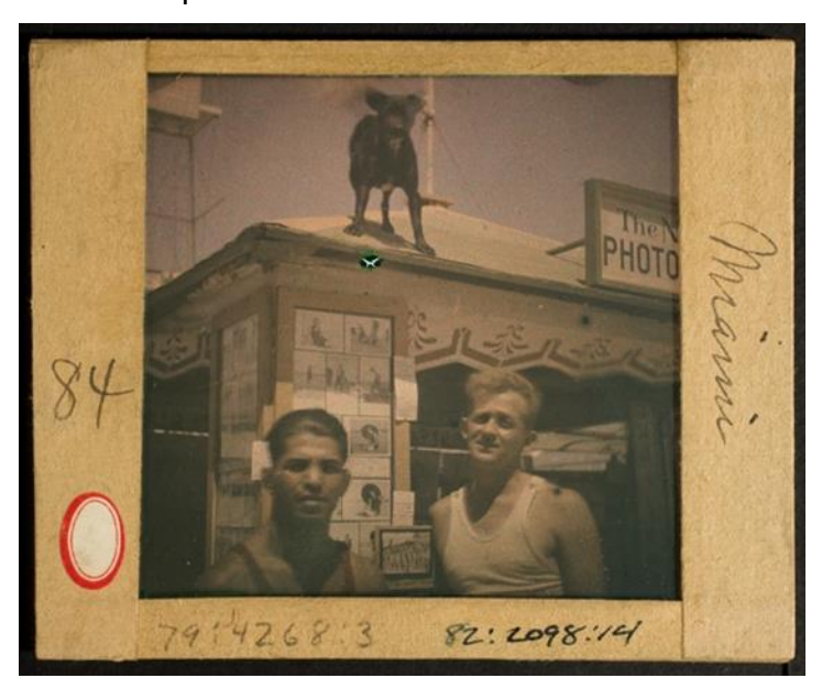
Figure 17: Charles Zoller, Miami [Two men outside photo shop], Autochrome, ca. 1923, Courtesy of George Eastman House/Gift of Mr. & Mrs. Lucius A. Dickerson, 1982:2098:0014.

Figure 17, captioned only, Miami . In this image, two men stand outside a photo shop with a dog on the roof. Both men wear tank tops as the man on the right squints into the sun. The image somehow appears to be of another era than the rest of Zoller's images, presenting an edgier side of Florida as well as having more of snapshot effect.