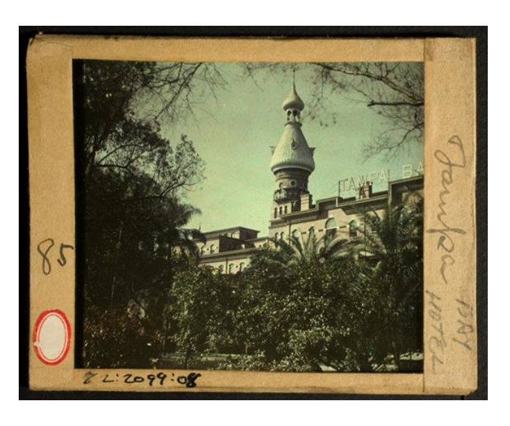
Figure 6: Charles Zoller, Tampa Bay Hotel, Autochrome, ca. 1923, Courtesy of George Eastman House/Gift of Mr. & Mrs. Lucius A. Dickerson, 1982:2099:0008.

Another such image, Taken in February St. Pete , (Figure 7), features a house with lush flowering foliage nearly blocking the entrance. One can imagine the reception of this image in Rochester, a city often covered in snow and ice in February. On the one had the images beckoned those viewers bundled in heavy coats, entreating them to the land of flowers. But there is an undercurrent of denseness here too, a sense that the jungle of Florida can readily reclaim the structures that replaced it.