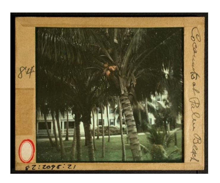
Figure 5: Charles Zoller, Cocoanuts [sic], Palm Beach, Autochrome, ca. 1923 Courtesy of George Eastman House/Gift of Mr. & Mrs. Lucius A. Dickerson, 1982:2098:0021.

Another such image, Taken in February St. Pete , (Figure 7), features a house with lush flowering foliage nearly blocking the entrance. One can imagine the reception of this image in Rochester, a city often covered in snow and ice in February. On the one had the images beckoned those viewers bundled in heavy coats, entreating them to the land of flowers. But there is an undercurrent of denseness here too, a sense that the jungle of Florida can readily reclaim the structures that replaced it.