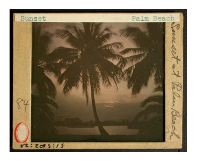
Figure 2: Charles Zoller, Sunset at Palm Beach, Autochrome, ca. 1923, Courtesy of George Eastman House/Gift of Mr. & Mrs. Lucius A. Dickerson,1982:2098:0018.

Autochromes were not only unable to register yellows accurately, they