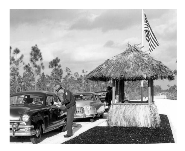
Fig. 2. Entrance to Everglades National Park, 1953, Photograph courtesy of State Archives of Florida, Florida Memory.