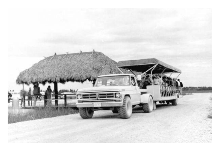
Fig. 6. Example of Everglades truck tour, 1973.