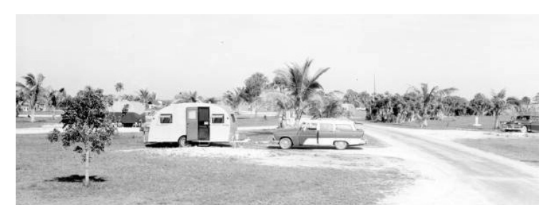
Fig. 4. Camping at Flamingo, 1960.

The surrounding landscape offered hiking trails converted from roads cut in the 1920s. These included the Coastal Prairie, Mangrove, and the Snake Bight Trails. Eventually, the NPS constructed boardwalks around Bear Lake and the Rowdy Bend. As Wirth predicted, cars continued to be the most popular way to get around the parks, and when Flamingo opened, rangers led auto tours on some of the trails (Blythe 2017, 192 - 193).