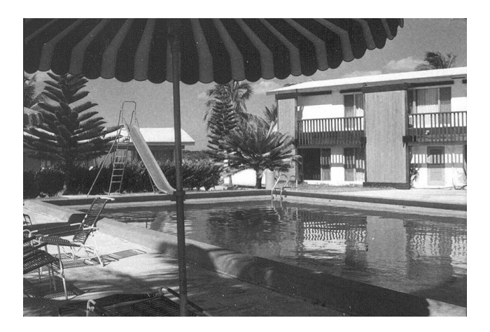
Fig. 5. The Flamingo Lodge included a pool. However, after two hurricanes, the lodge was demolished and the pool was filled in 2006.