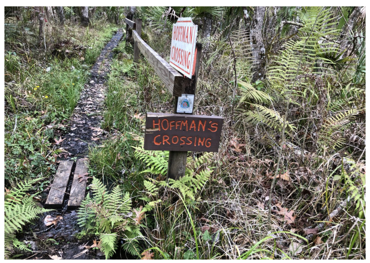
Fig. 10- A section of Hoffman Crossing near the south end.

The 1,886-foot narrow boardwalk, named for Jake Hoffman, takes hikers across a lateral extension of the Rice Creek Swamp. The walkway is