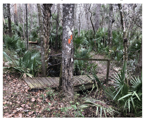
Fig. 4- Orange "blazes" on trees along the Florida Trail vegetation, with tree-like saw palmettos

three-mile stretch of the P-LB State Trail where it approaches the bike trail bridge, and along the Woodland Florida Trail south of SR 100. On the south side of SR 100, hikers are greeted with one of the familiar Florida Trail signs, showing the site for the local entry to