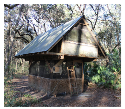
Fig. 6- Rice Creek "Hilton," camping area on the Florida Trail

The Hilton was designed and built by Jake Hoffman and is truly a unique structure (Figure 6).