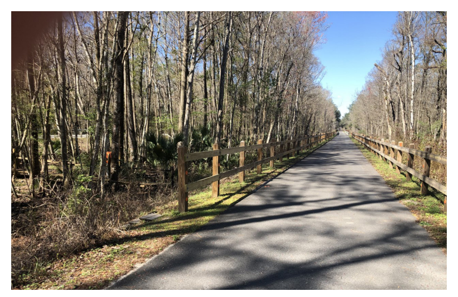
Fig. 3- P-LB Bike bridge over Rice Creek at SR 100

The Florida Trail extends south from the Etoniah Creek State Forest, following several rural roads, and eventually merging with the Palatka-to-Lake Butler State Trail (P-LB Bike Trail) at Carraway Church Road. From this point, the Florida Trail and the state trail co-exist as one for about three miles. The Florida Trail splits from the state trail on the east side of the Rice Creek bridge (Figure 3). At this departure, the hiking trail descends down the state trail embankment to the McKinney boardwalk and SR 100.