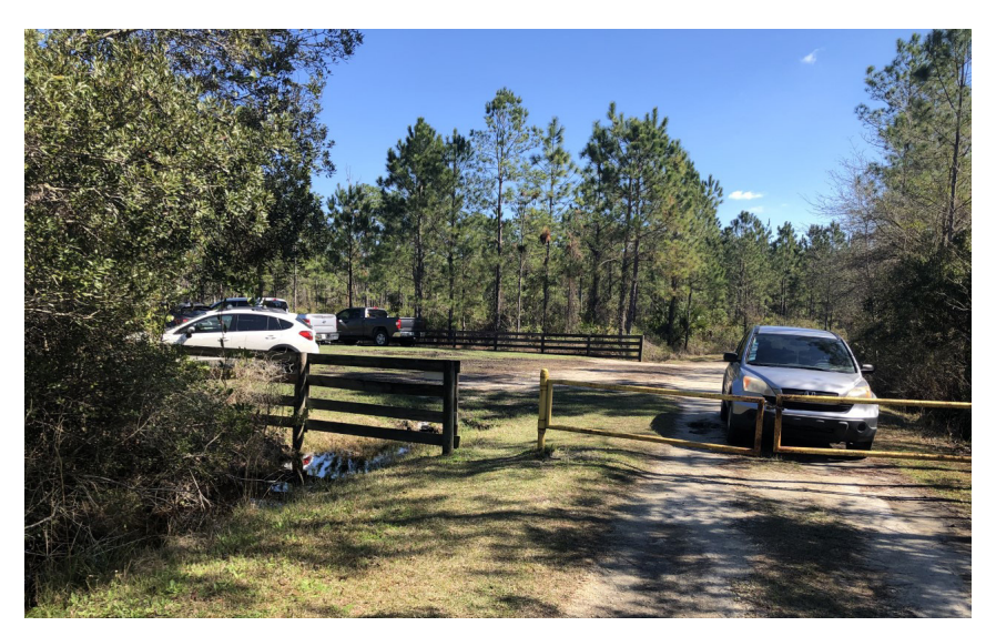
Fig. 2- Rice Creek Conservation Area, East Trail Parking

with thick under-stories of wax myrtle and gallberry. The pineland on the west side of the road eventually gave way to a clear-cut section that had been recently replanted with longleaf pines. The entry road eventually merged with the Florida Trail at the Big Oak picnic/camp area (site of the Rice Creek "Hilton"). We dismounted to explore these trail-side amenities and to walk along levees that enclosed the former rice plantation.