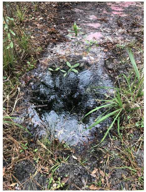
Fig. 9- Plus-One Sulfur Spring, on the south end of the Hoffman Crossing. Note the spring pool and the rosy-red growths on the sulfur bacteria in the spring run

A small spring, located at the south portal to the Hoffman Crossing, is particularly odoriferous with the smell of sulfur dioxide. Wandering anywhere near it, you smell its bubbling water shouting at you "Sulfur Spring!" The bottom of the spring and its accompanying run is coated with thick deposits of stringy sulfur-fixing bacteria, clinging to wood, dead leaves, and other debris that form the bottom substrate (Figure 9). Its most peculiar