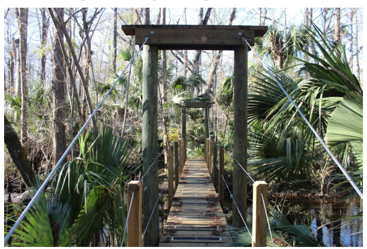
Fig. 8- Suspension bridge, on Loop Trail around the rice plantation

About half way around the levee loop trail, a second trail, blazed with yellow, splits from the primary loop. This spur is labeled as the Cedar Swamp